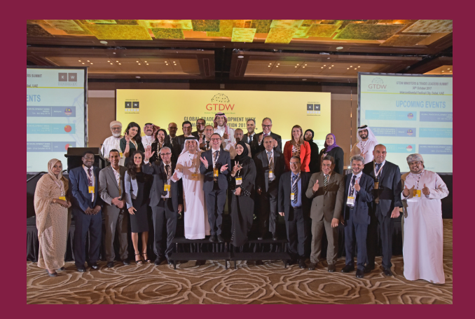
Islamic Development Bank, Arab Ministers Meeting hosted by UAE Ministry of Economy & KW Group