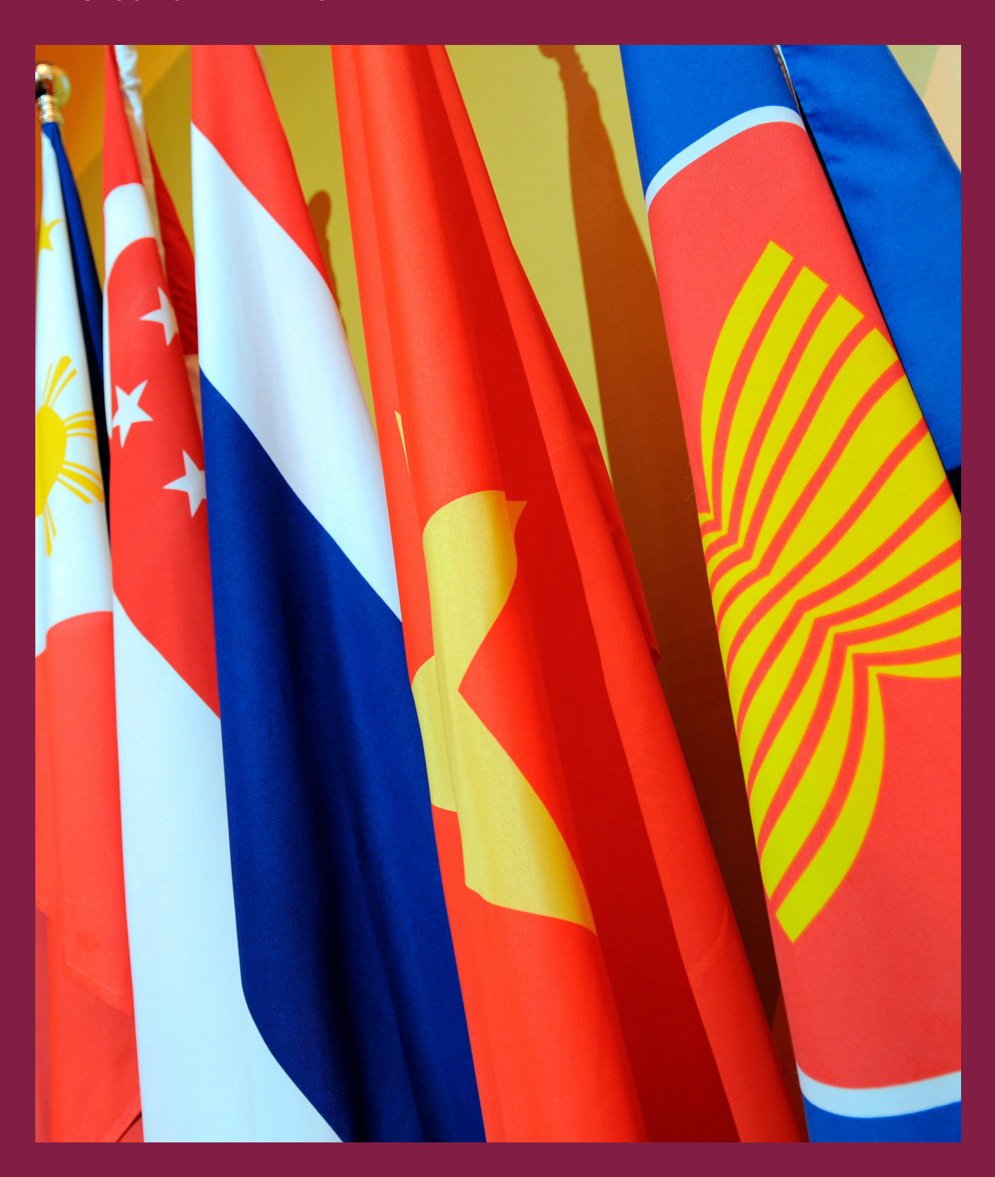
KW GROUP ASIA: FDI, Trade Innovation & Digitalisation Consulting, Events, Intelligence